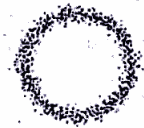
n = 100