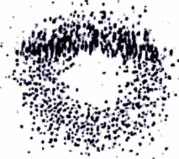
n = 10