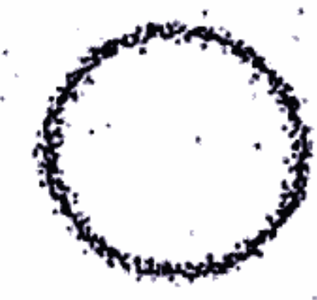
n = 1000