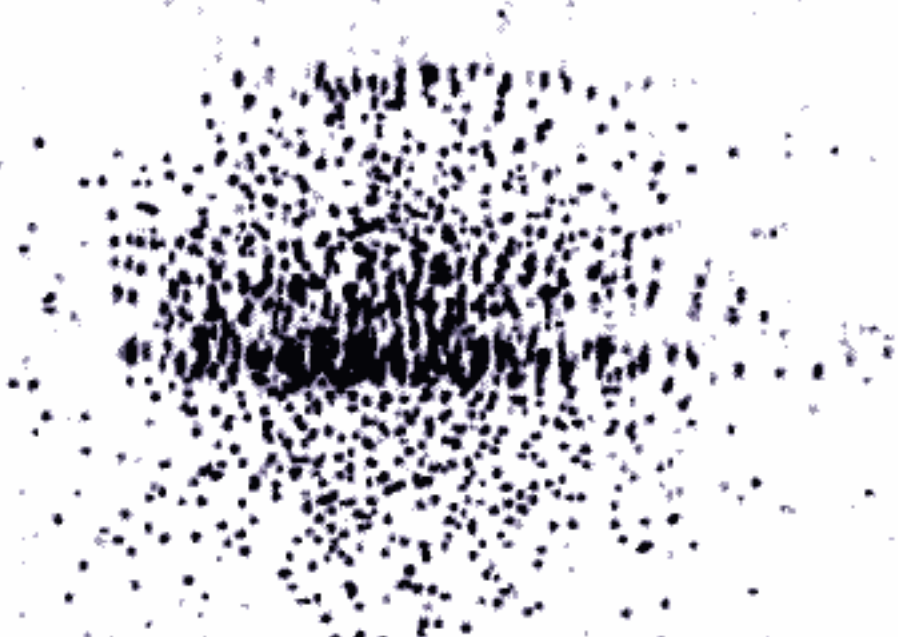
n = 2