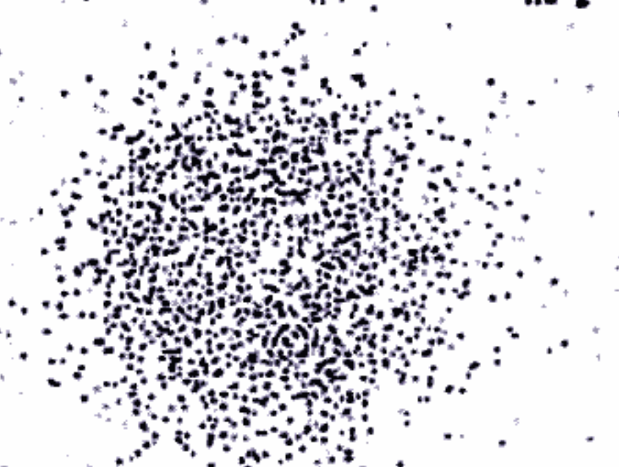
n = 3